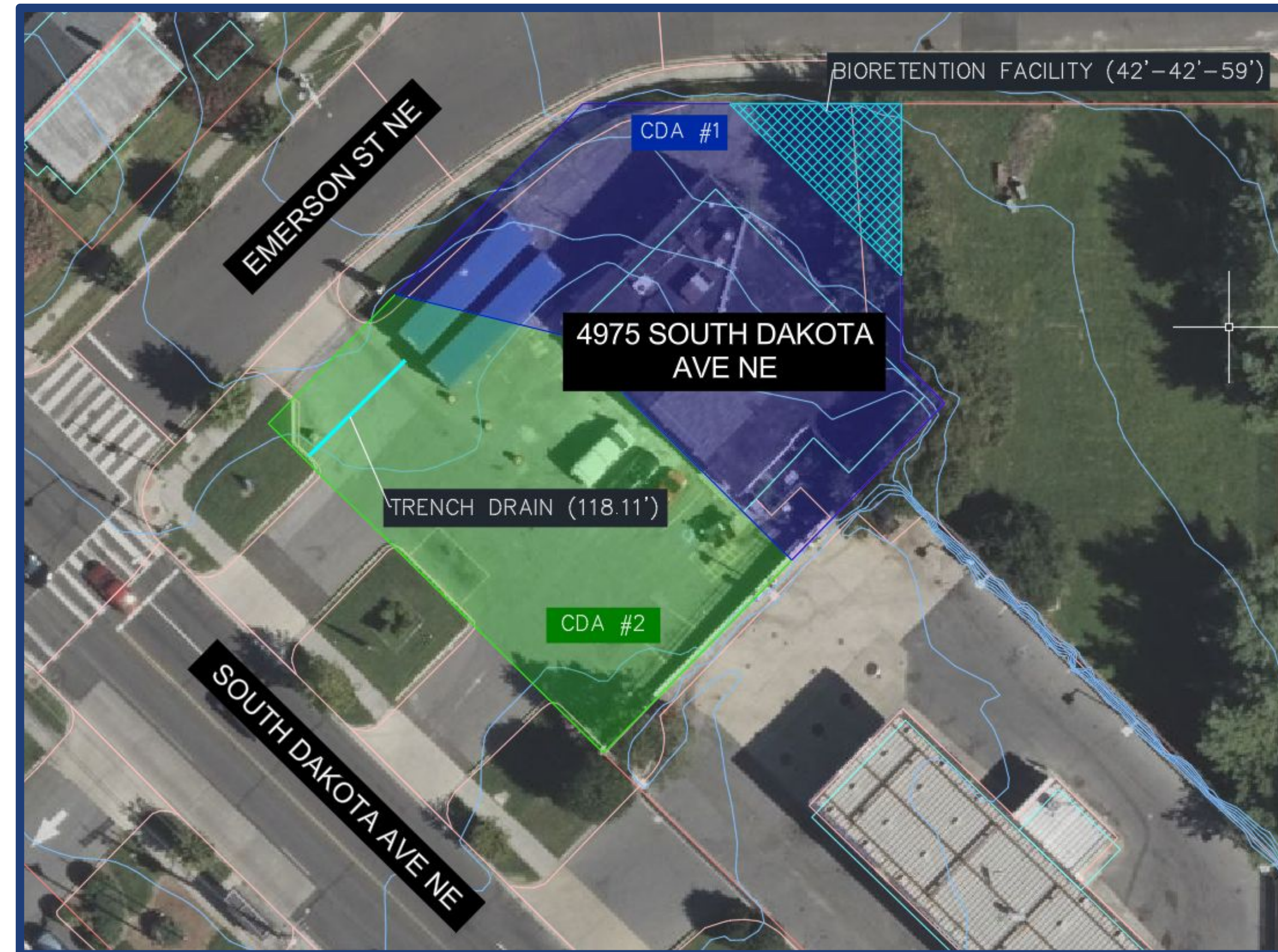
Preliminary Site Design for East Market

The goals of this project are to explore and enhance current GSI practices to further mitigate the impacts of runoff from urban development.