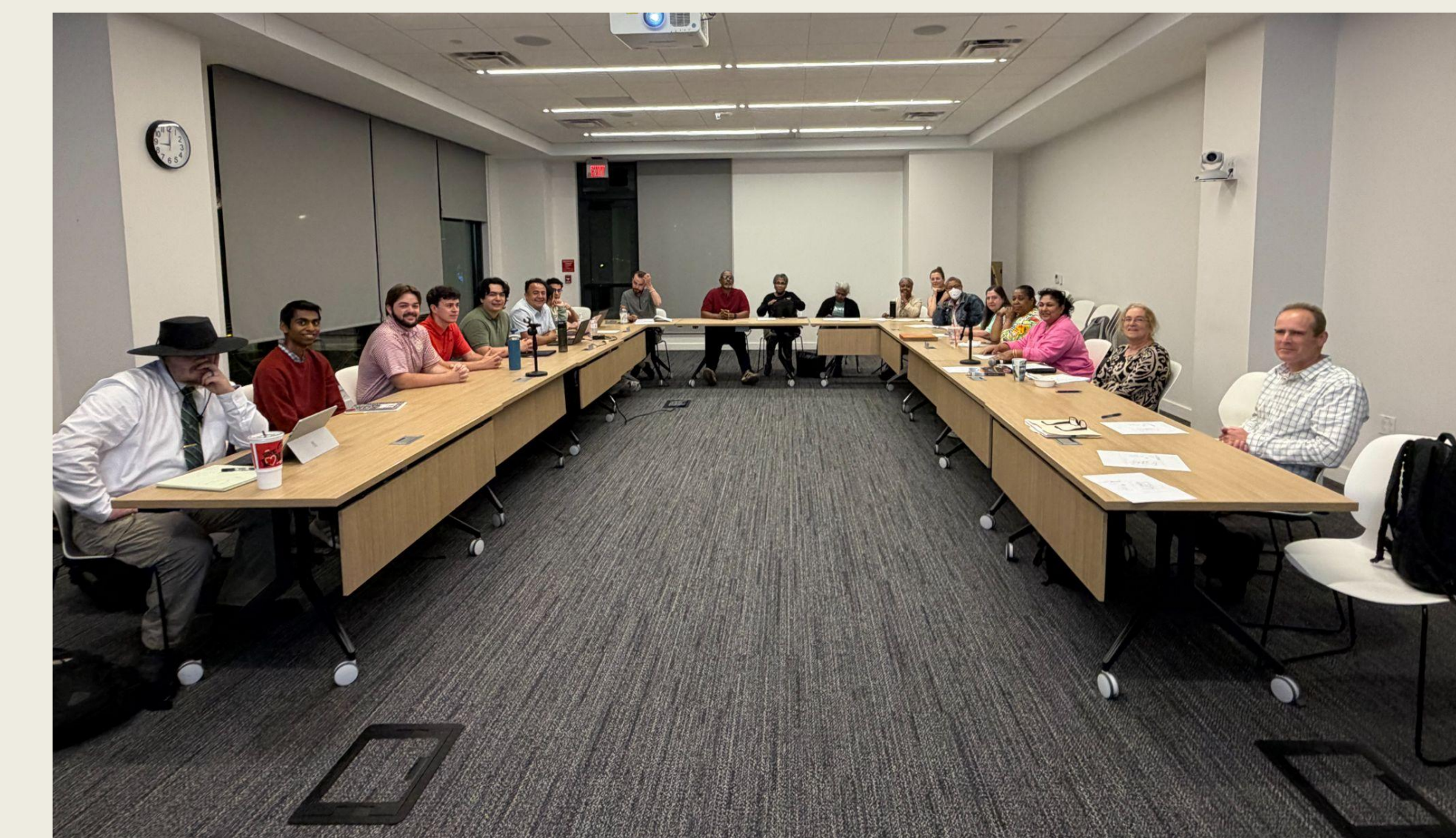
Engagement Meeting From April 23rd, 2026