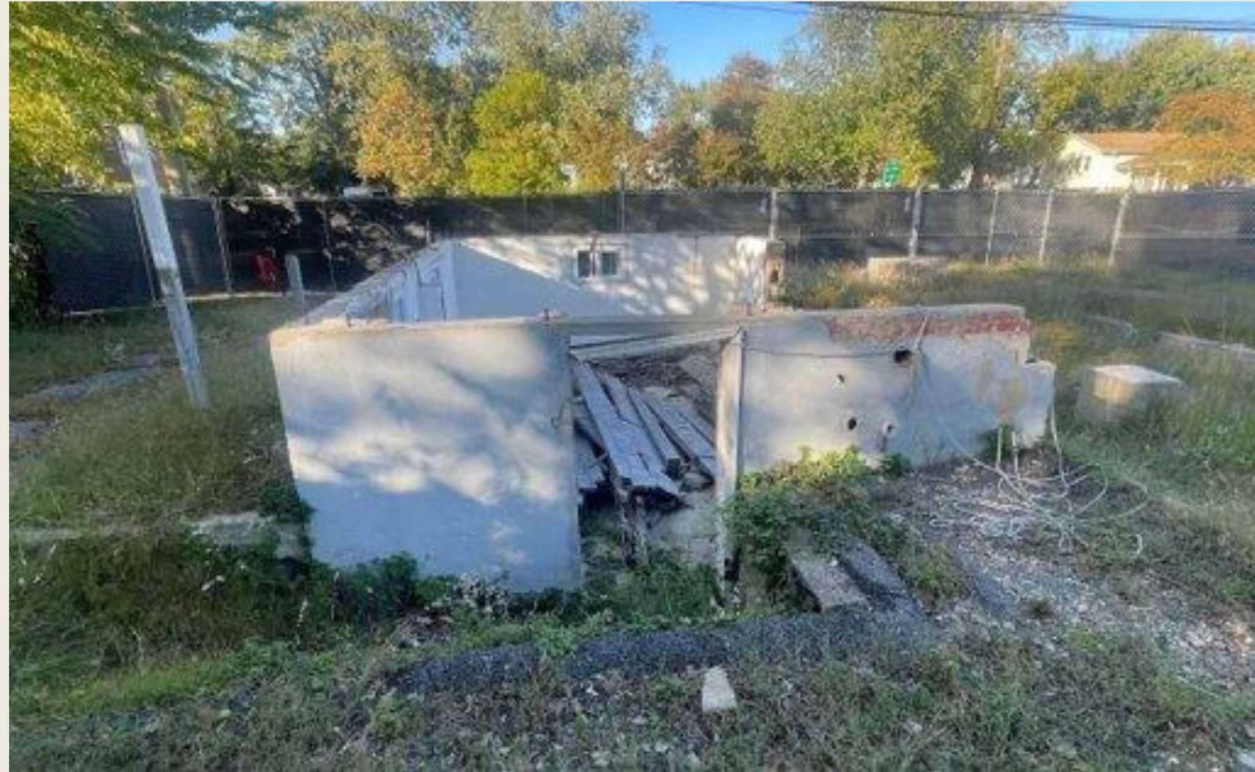
Current Site Conditions

5021 Lakeland Rd is an abandoned property located in College Park, MD. The property was previously a residential duplex, and was damaged beyond repair by a storm in 2022. The site is currently owned by the City of College Park, with plans to be redeveloped into an affordable housing unit that reflects the Lakeland community.