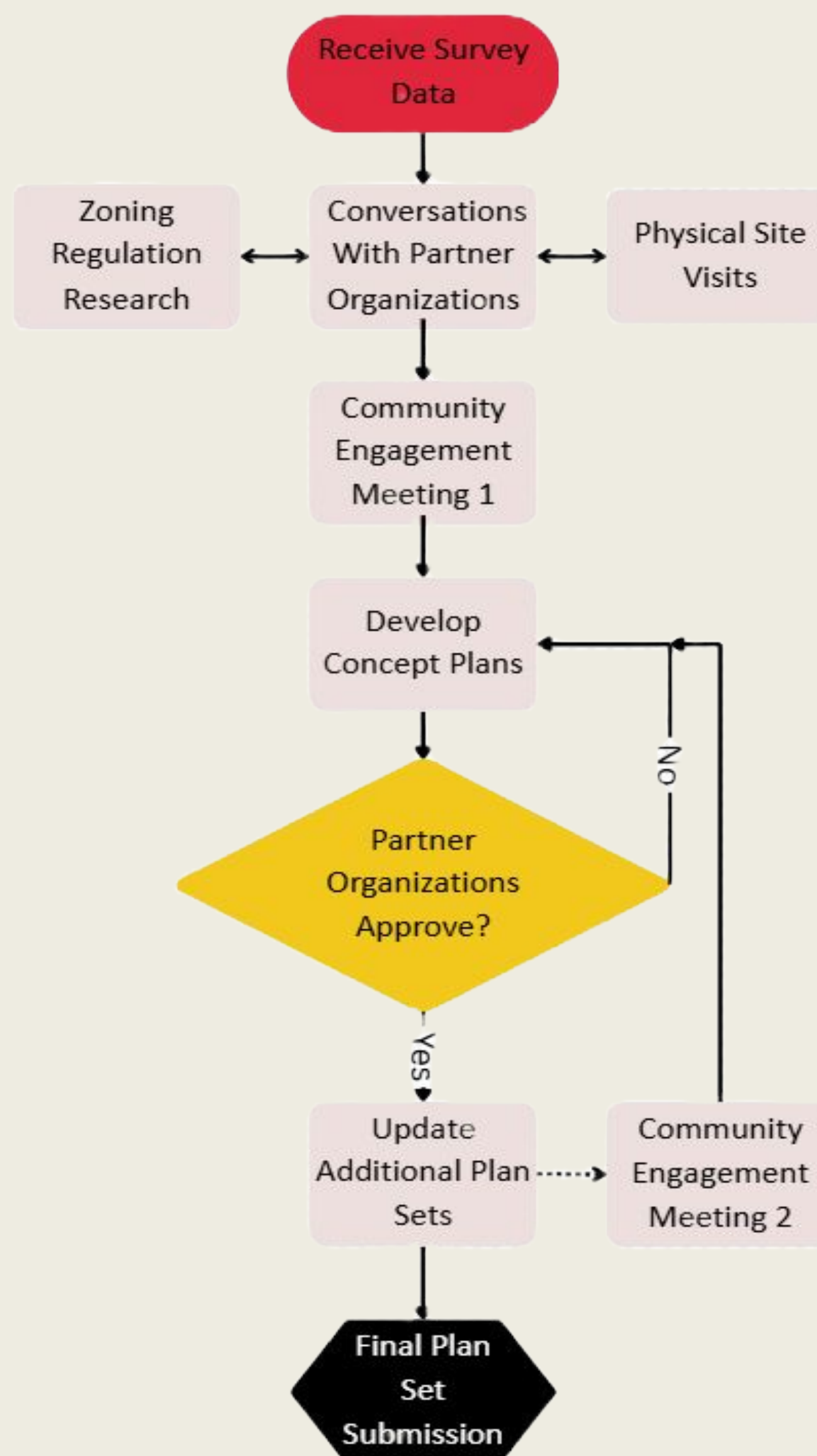
Design Process Flow Chart

The existing conditions of the site were modeled in Civil3D based on previous surveys of the site, online geographic data and physical observations and measurements. This model was used to create 3 different concept plans for potential development, including the locations of all structures, demolitions, utilities, and grading. In order to ensure effective local communication, multiple community engagement meetings were held. These plans went through multiple cycles of feedback and updating, as shown in the figure to the left, ultimately creating the final plan set shown here today.